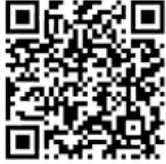
INDUSTRIAL GENERATOR HAHN & SOHN HDE20SS3-DW